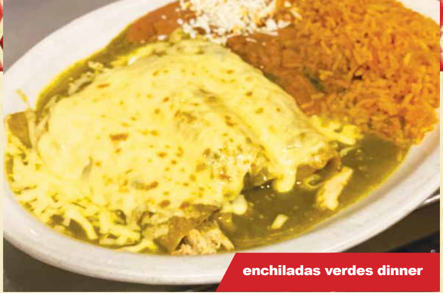
enchiladas verdes dinner