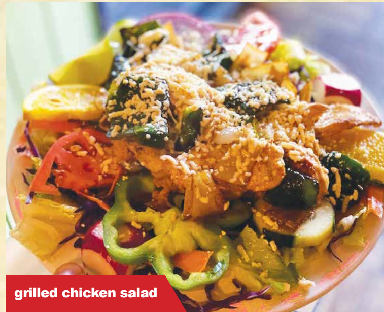
grilled chicken salad

A big combo platter of popular appetizers: chicken fingers, two pork tamales, two pico de gallo quesadillas and two chicken flautas with sour cream, guacamole, pico de gallo, lettuce and cheese sprinkled on top. Great for sharing or as a meal 16.31