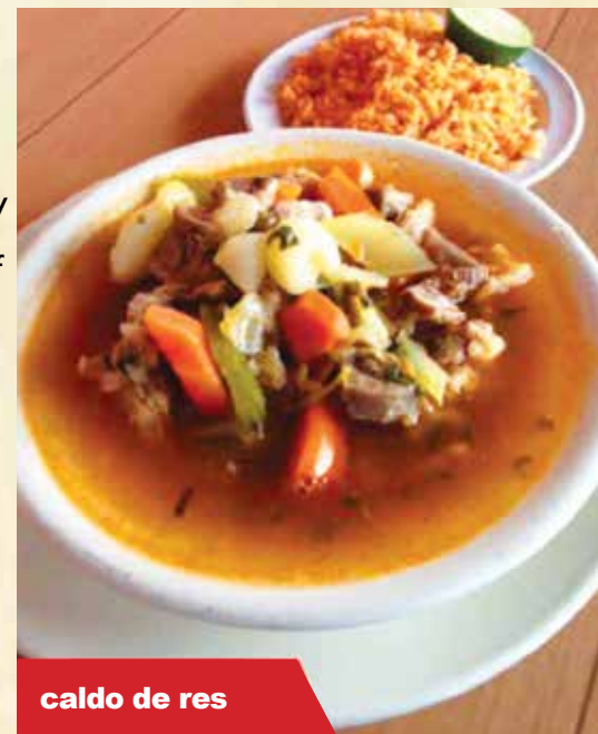
caldo de res

Our slow-simmered tripe soup is a true Mexican tradition. Served with choice of tortillas 8.37 (We'll add hominy to the soup upon request)